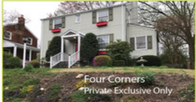
Four Corners Private Exclusive Only

Whether you want to buy and then sell -- or sell and then buy -- or maybe your goal is to buy and sell simultaneously -- we've got the matchmaking expertise to make it happen! In a tight and competitive market such as ours, buyers and sellers need us more than ever to not only help them sell for the highest return, but also to make sure they're able to secure the new home of their dreams.