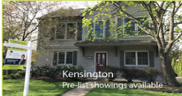
Kensington Pre-list showings available