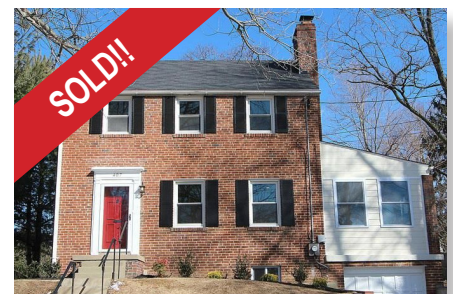
407 Brewster Avenue Contract in 6 days with multiple offers! Immaculate 3BR/2.5BA.