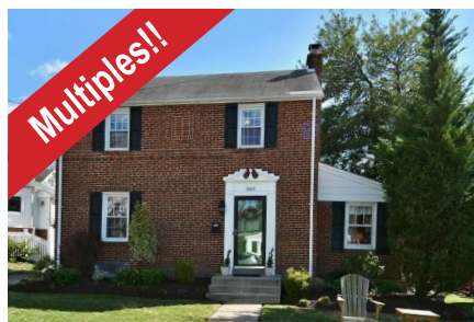
9605 Clearview Place Multiple offers on this exceptional, expanded home.