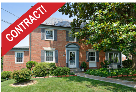
208 East Indian Spring Drive Updated and expanded colonial under contract.