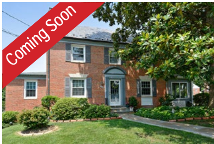
208 East Indian Spring Drive Updated and expanded colonial coming soon.