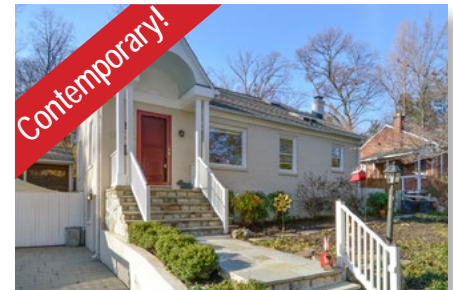
9322 Caroline Avenue Pristine, renovated cape tucked away on private lot. $499,900