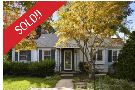
104 East Hamilton Avenue Multiple offers!