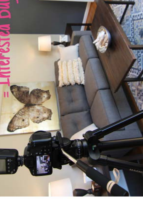
good photography helps to sell a home faster and for more money. That's because a good