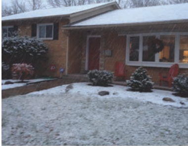
Before and After 2nd Story Addition

Take advantage of this special discounted rate of 4 hours for only $80!