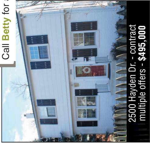
2500 Hayden Dr. - contract multiple offers - $495,000