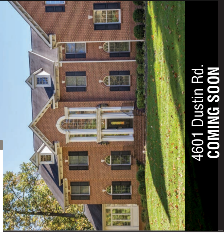
4601 Dustin Rd. COMING SOON