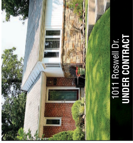
1011 Roswell Dr. UNDER CONTRACT