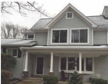
Beautiful Finished Kitchen