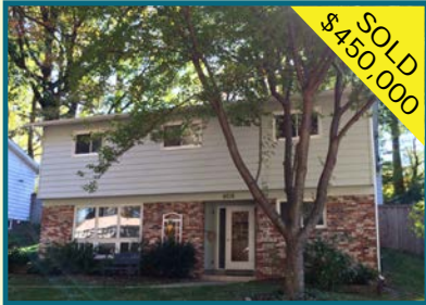
4016 Simms Drive Kensington, MD 20895

"You were perfect for us. You get things done and you are so easy going. Thank you from the bottom of our hearts."