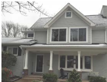
Beautiful Finished Kitchen