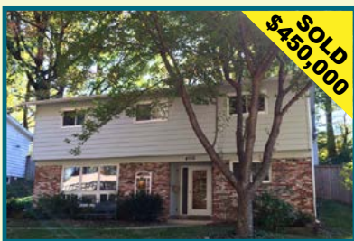
4016 Simms Drive Kensington, MD 20895

"You were perfect for us. You get things done and you are so easy going. Thank you from the bottom of our hearts."