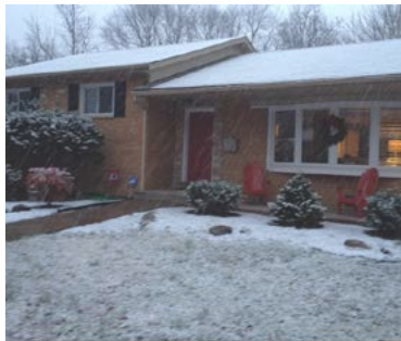
Before and After 2nd Story Addition