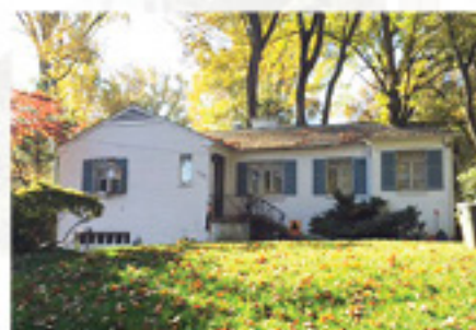
10709 Lorain Ave. Woodmoor! 3BR/2BA w/en suite master bath. Garage and large fenced lot. $399,900.