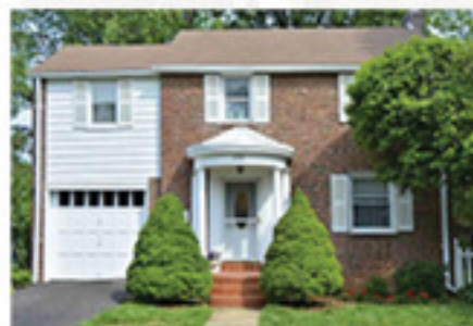
103 Normandy Dr. Pristine, renovated and expanded 3BR/2BA Colonial. $515,000.