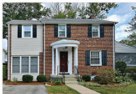
103 Granville Dr. Pristine 3BR/2BA Colonial w/gourmet KIT and designer finishes. Large, level fenced yard. $533,900.