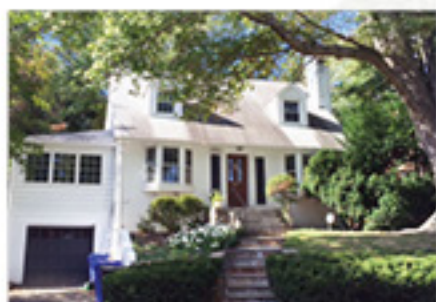
9606 Bruce Dr. Beautiful Cape Cod in sought-after North Hills. Deep, expansive lot.