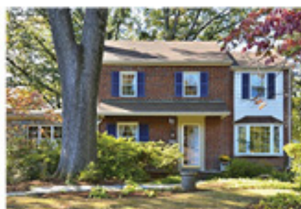
9012 Sudbury Rd. Pristine, updated 3BR/1.5BA Colonial with large KIT and expansive living room/dining combo. $519,000.