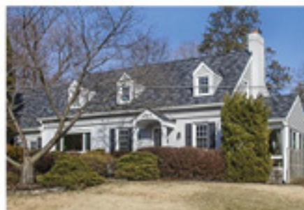
9901 Indian Ln. Exceptional 3BR/3BA Cape with garage. Private yard on quiet corner. $639,999.