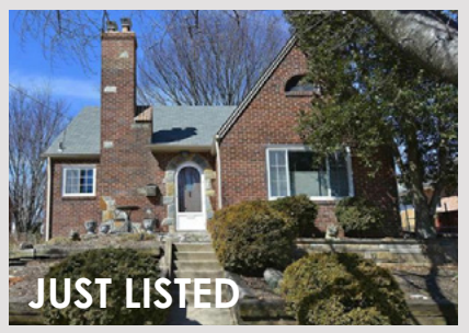
205 Franklin Ave. Sunny, renovated 3BR/3BA Tudor with upscale kitchen. $499,000.