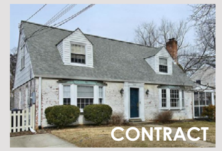
113 Granville Dr. Under Contract in just 7 days! 4BR/3BA brick Cape. $543,000.