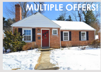
9413 Caroline Ave. Fabulous, expanded country cottage with 3BR/2BA. $419,900.