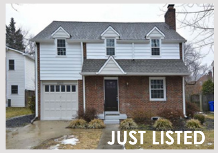
9705 Lawndale Dr. Superb renovation and expansion. 3BR/2.5BA. Do not Miss! $599,900.