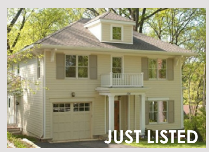
126 Hamilton Ave. Upscale, custom-build 5BR/4BA Craftsman. $829,000.