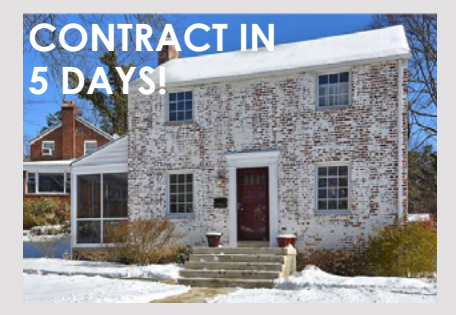
9331 Caroline Ave. Exceptional 3BR/2BA Colonial. Multiple offers! $475,000.