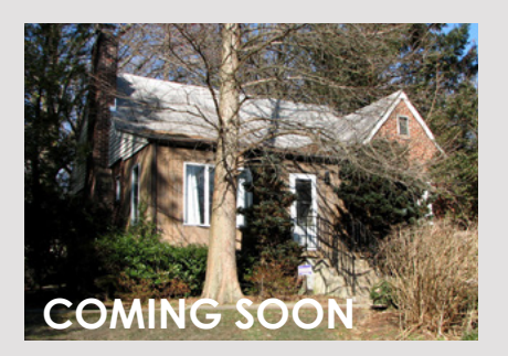
9 Lauer Ter. Coming Soon! Super cute 4BR/2BA Cape. Renovated throughout.