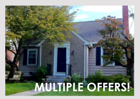
9505 Evergreen St. 3BR/1BA Cape with upscale KIT and updates throughout! $399,900.