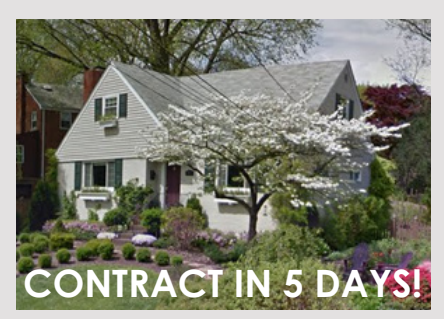
101 Hamilton Ave. Renovated and expanded 4BR, 3BA country cape. $579,000.