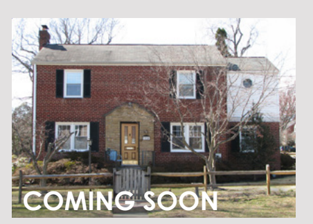
9514 Caroline Ave. Coming Soon! Exceptional, expanded 4BR/3.5BA Colonial. Pristine!