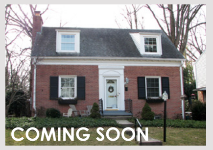
9214 Whitney St. 4BR/2.5BA Cape with screened in porch and fully finished basement.