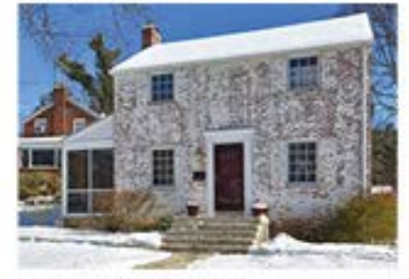
9331 Caroline Ave. Exceptional 3BR/2BA Colonial with upscale amenities throughout. English Gardens. $475,000.