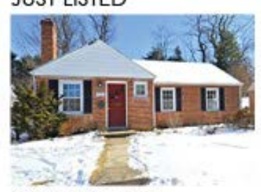
9413 Caroline Ave. Fabulous, expanded country cottage with 3BR/2BA renovated from top to bottom. $435,000.