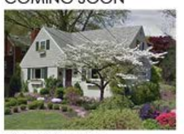
101 Hamilton Ave. Renovated and expanded 4BR/3BA country cape. High-end details, exquisite gardens.