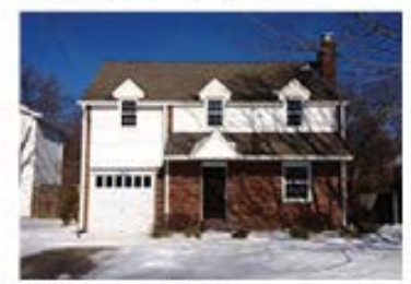
9705 Lawndale Dr. Superb renovation and expansion. 38R/2.5BA. Master w/ensuite bath. Do not Miss!