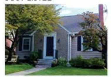
9505 Evergreen St. 3BR/1BA Cape with upscale KIT, glowing hardwoods & updates throughout! $399,900.