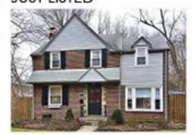
9628 Lawndale Dr. Stunning 3BR/2BA Colonial with designer touches and upscale features throughout. $525,000.