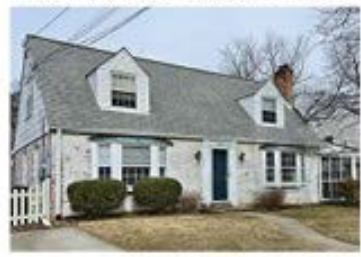
113 Granville Dr. Under Contract in just 7 days! Renovated 4BR/38A move-in ready, brick Cape. $543,000.