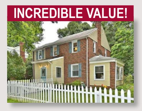
9607 Hastings Dr • $374,900 Spectacular space plus garage!