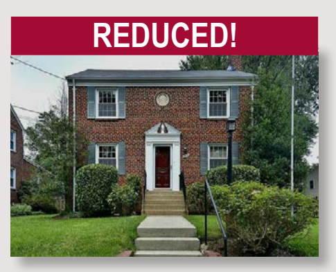
9405 Seminole St • $449,999 Lovely Colonial with many upgrades!

Selling more homes in the Indian Spring community than our top two competitors combined!