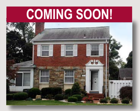
209 East Indian Spring Drive Larger model Colonial. Custom build!