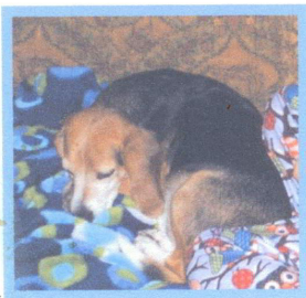
Beckham, our beloved beagle

Please contact us via text message or email :