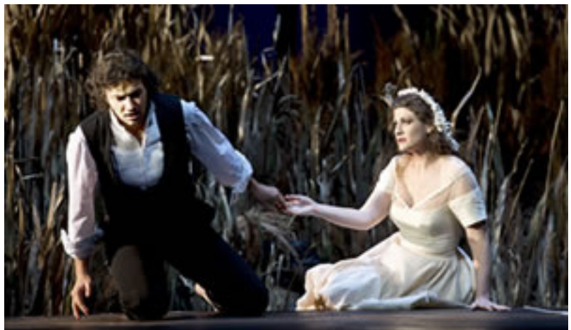
Teatro alla Scala production of Lohengrin from Opera in Cinema

Please submit any topic you would like to see explored to cynthiajal@verizon.net . *