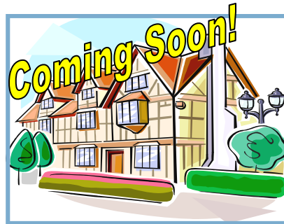
9623 Brunett Ave – early 2013 New Construction !