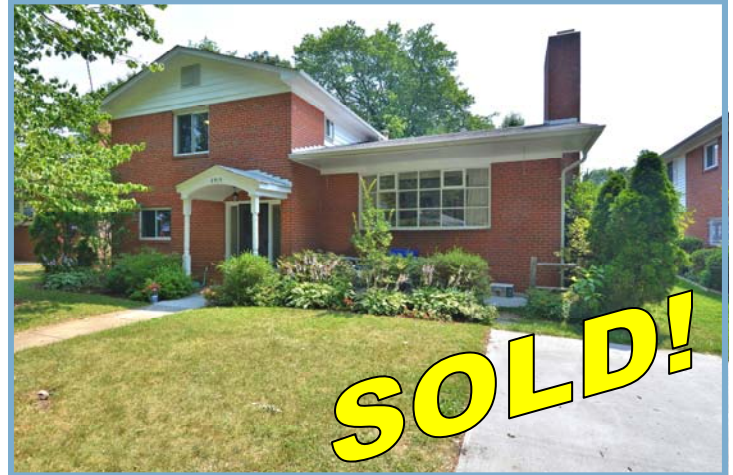
9515 Flower Ave—$425,000. Multiple Offers! FULL PRICE!