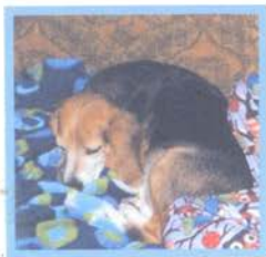
Beckham, our beloved beagle

Coupon required. Cannot be combined with other offers. No cash value. Please mention ISCA at time of booking.