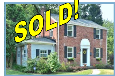
10016 Sidney Rd MULTIPLE OFFERS $18K over list!

In the last three months, the Tamara Kucik Team has sold 25 Silver Spring homes