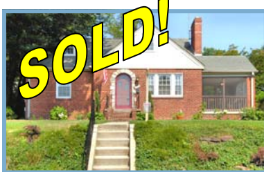
9922 Markham St Private Sale!