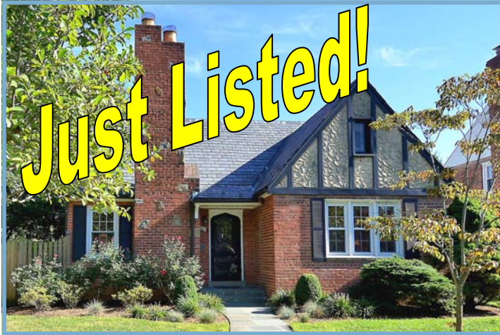
9621 Evergreen St —$450,000. Stunning Tudor on premium lot

The weather is cool, the market is hot! The Tamara Kucik Team keeps Indian Spring on fire!