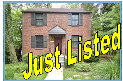
9412 Biltmore Dr. Sweet Colonial. $420,000.

And there's lots more online at www.tamara4homes.com