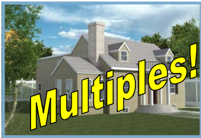
10402 Ridgemoor Dr $629,900. June 2012 delivery.