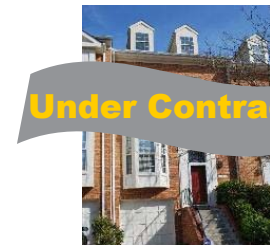
5 Suncroft Ct 3 BR/2 FB/1 HB, $355,000