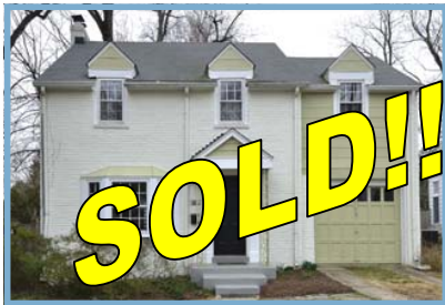
102 Granville Rd. Sold for List Price!