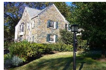
9110 Fairview Rd 4 BR/3 FB/1 HB, $789,000