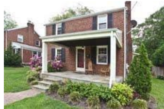
9603 Clearview Pl 4 BR/3 BA, $549,000