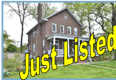
9511 Colesville Rd. $585,000. Fully Renovated.