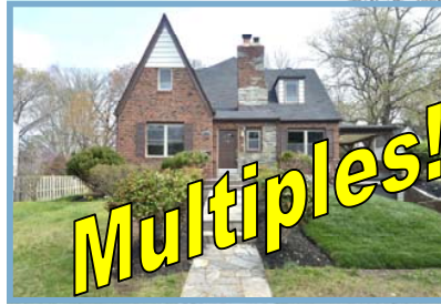
9107 Flower Avenue Custom home. $589,900.