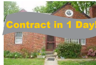
410 Brewster Ave 3 BR/2 BA, $499,000