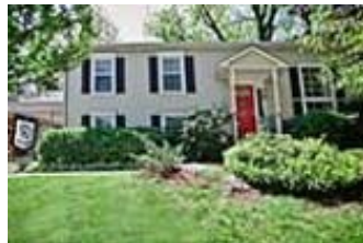
804 Guilford St 3 BR/2 BA, $439,000