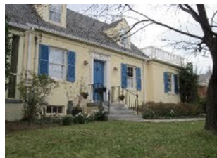
105 St. Lawrence Dr 3 BR/2 BA, $525,000