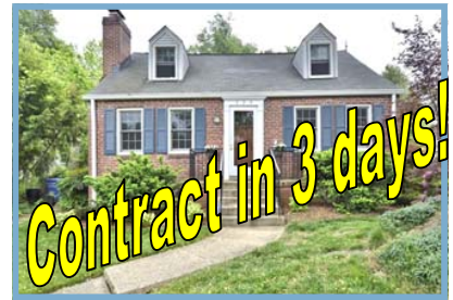
324 Branch Ave. $529,900. Woodmoor Beauty.