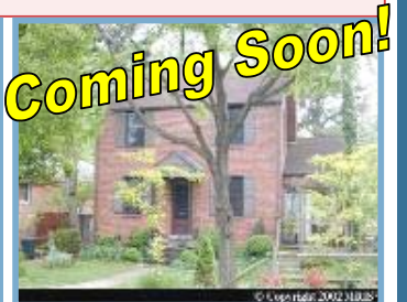
9412 Biltmore Rd. list in low $400s