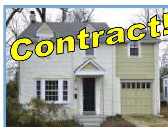
102 Granville Rd. Contract in 2 DAYS!