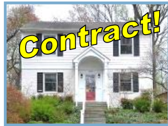
10620 S. Dunmoor $499,900