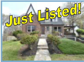
9107 Flower Ave. $589,900