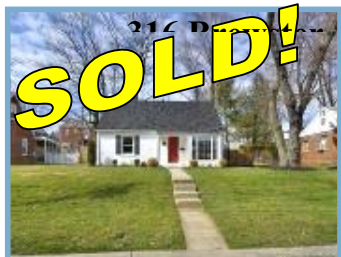
311 Ladson St. $349,900.