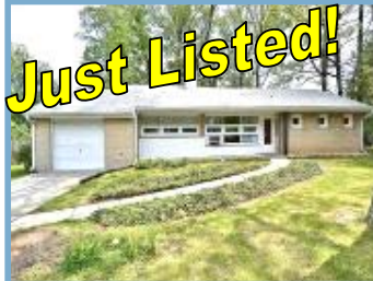
740 Dennis Ave. $309,000.