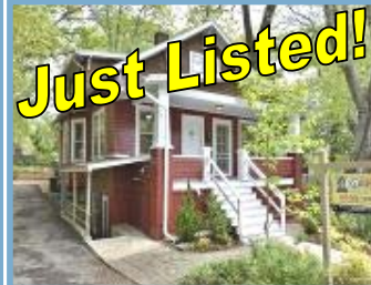
7301 Flower Ave. $550,000