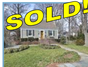
10518 Lorain Ave. $519,900. CASH OFFERS!