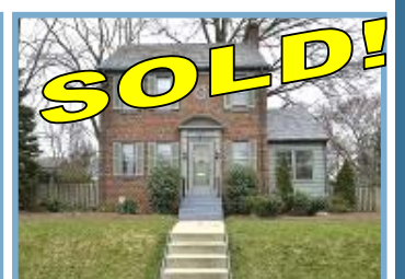
9423 Thornhill Rd. $639,900.