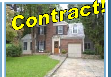
4005 Saul Rd. Kensington $800,000.