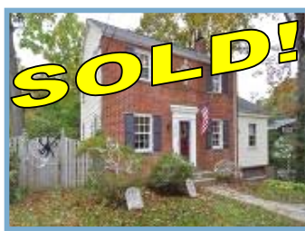
8910 Bradford Rd. $489,900.