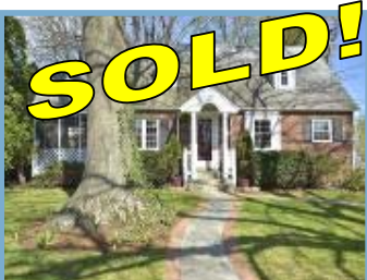
10512 Lorain Ave. $539,900 CASH OFFERS