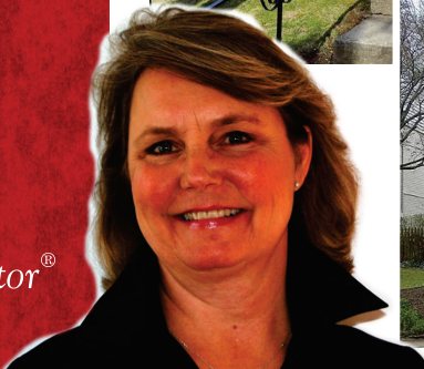
2809 Washington Avenue