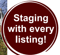
9506 Wire Avenue