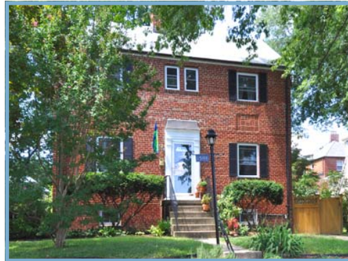
9506 Wire Avenue