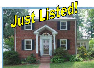
9013 Walden $479,900