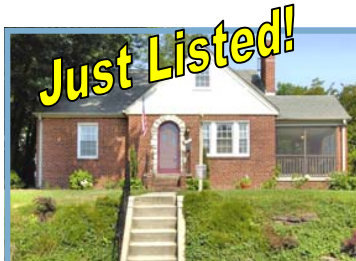
9922 Markham St $499,900