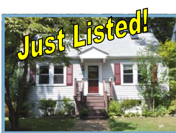
9702 Lorain Ave $400,000