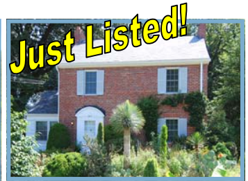
9117 Flower Ave $499,900