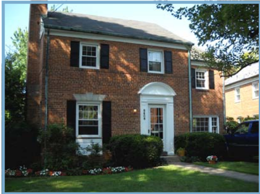
9604 Garwood Road