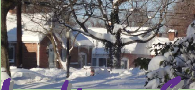
February 2010 Blizzard in Indian Spring