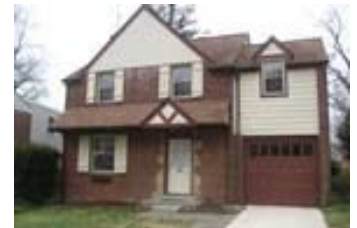
114 Granville Drive