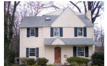
9711 Lawndale Drive