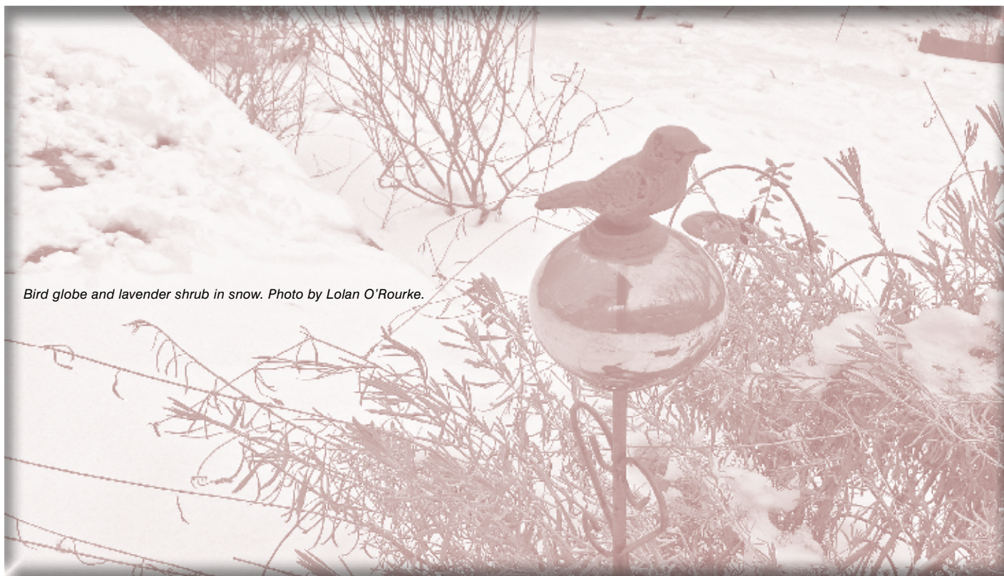
Bird globe and lavender shrub in snow.

7:30 p.m.– 9 p.m. Silver Spring Citizens Advisory Board, Transportation and Pedestrian Safety Committee Silver Spring Regional Center 8435 Georgia Avenue