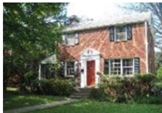
222 Baden Street