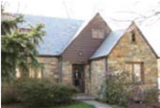
9412 Saint Andrews Way