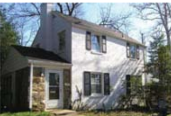
1602 Springwood Drive