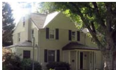
9626 Lawndale Drive