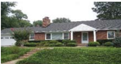
9607 Flower Avenue