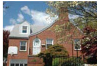
203 Franklin Avenue