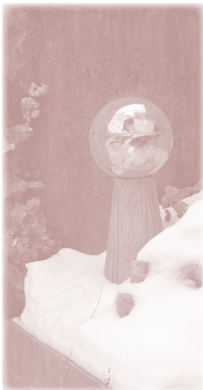
Garden globe in snow.

Thanks to all who help in big and small ways to make Highland View a wonderful neighborhood school. To get involved or learn more, please contact the school at 301-650-6426 or visit www.hvespta.com . *