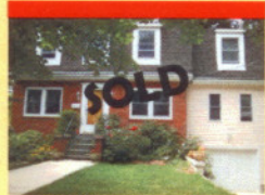
406 Leighton Ave $550,000