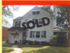
9706 Lawson Pl $559,000