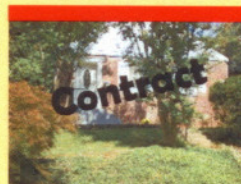
109 Melbourne Ave $309,000