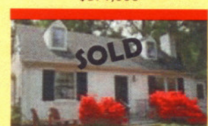
10803 Lorain Ave $535,000

* Information provided by MRIS and includes only homes listed in MRIS system and does not include homes sold by owner. Information reliable but not guaranteed.