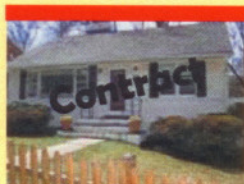
25 Eastmoor Dr $449,000