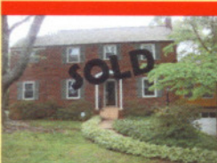
9601 Sutherland Rd $640,000