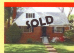
101 Hamilton Ave $565,399