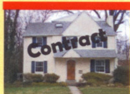
9711 Lawndale Dr $489,000