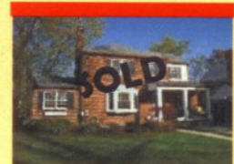
9705 Fairway Ave $579,000