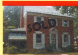
9520 Biltmore Dr $429,000