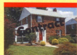
125 Normandy Dr $399,000