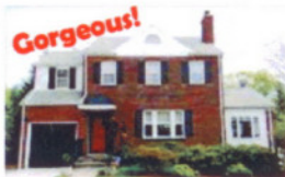
224 Shorey Road 3 BR, 3 FB, $549,000

Evidence? Even in 08's tough market, we listed more than 30 homes and 50% sold in less than 30 days. Check out a few of our current listings. More on helpmerhondarealestate.com !