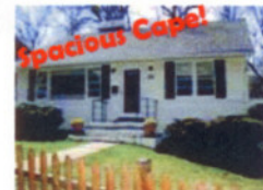
25 Eastmoor Drive 4 BR, 2 FB, $479,000