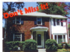
9 Normandy Drive 3 BR, 2 FB, 1 HB, $464,900