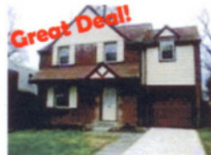
114 Granville Drive 3 BR, 1 FB, 1 HB $469,000