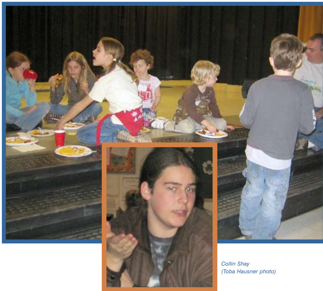
Young Tasters on stage