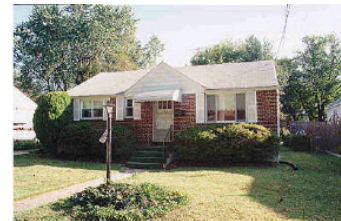
12819 Matey Road Silver Spring 3 BR, 2 FB $385,000