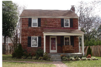
9603 Clearview Pl Silver Spring 3 BR, 3 FB $539,000