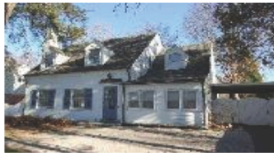
120 University Blvd E Silver Spring 4 BR, 2 FB, 1 HB $449,000

Check Out Just A Few of My Listings – More on www.helpmerhondarealestate.com !