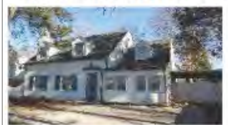
120 University Blvd E 4 BR, 2 FB, 1 HB