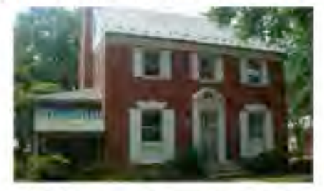
9520 Biltmore Dr 3 BR, 1 FB, 1 HB