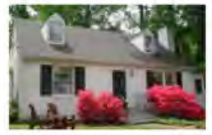
10803 Lorain Ave 4 BR, 2 FB