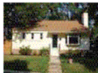
501 Royalton Rd, Silver Spring 3 BR, 2 FB $399,900

Check Out Just A Few of My Listings – More on www.helpmerhondarealestate.com !