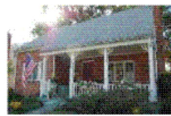
9612 Bristol Ave Silver Spring 4 BR, 2 FB $492,000