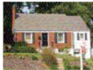
806 Buckingham Dr, Silver Spring 3 BR, 2 FB $399,000