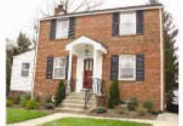
9508 Garwood St, Silver Spring 3 BR, 2 FB $499,000