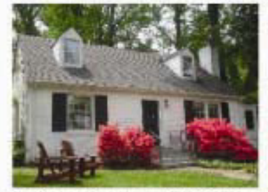
10803 Lorain Ave, Silver Spring 4 BR, 2 FB $579,000