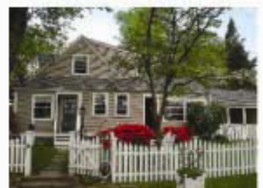
11301 Norris Dr, Silver Spring 4 BR, 2 FB $525,000